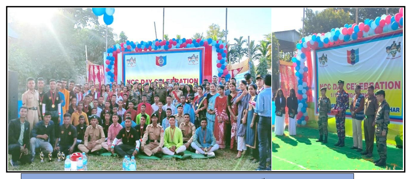
NCC Day celebration at the A.B.N Seal College on 27th November

Date of Event: 27-11-2022 No. of Participants Staff: 15 Students (Male): 46 Students (Female): 36