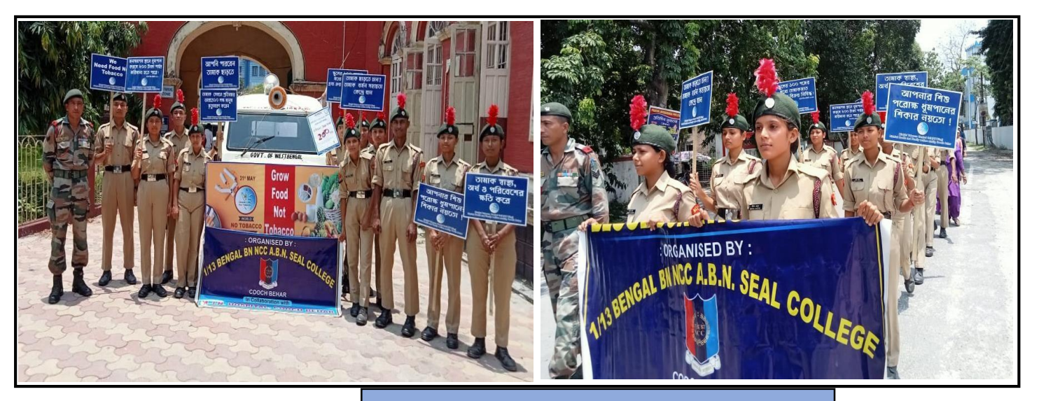
Cadets participate Anti-Tobacco Day Rally

10. WORLD ENVIRONMENT DAY (Awareness programme): Total No. of Participants is 64 (Staff: 05 Students (Male): 34 Students (Female): 25). The United Nations designated 05 June 2023 as