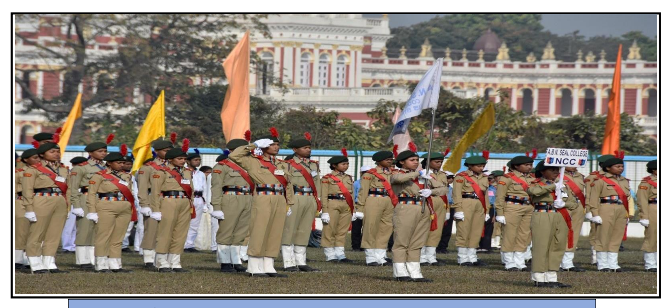
Cadets of 1/13 Bengal BN NCC A.B.N Seal College Participate in Republic Day Parade

7. REPUBLIC DAY: Republic Day is celebrated on 26<sup>th</sup> January every year. RDC (Republic Day Camp) conducted by the DG National Cadet Corps in every year. Selected cadets from different directorates of the state participate in this National camp, Dated on- 26-01-2023. Total No. of Participants is 94 (Staff: 07 Students (Male): 49 Students (Female): 38).