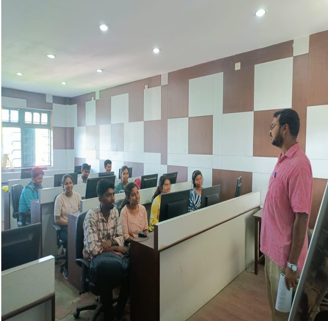
Picture of Class