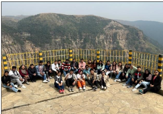
Group Photo of students