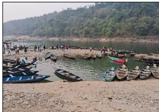
Dawki river at India-Bangladesh Border