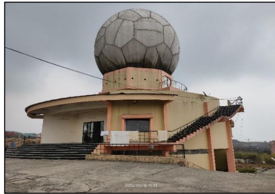
Meteorological Station, Sohra