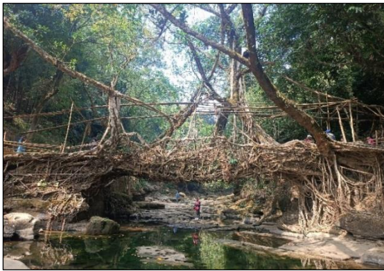
Single Decker Living Root Bridge, Mawlynnong