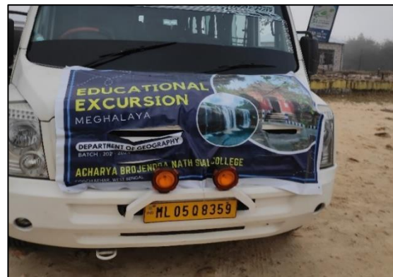
Vehicles used for field survey