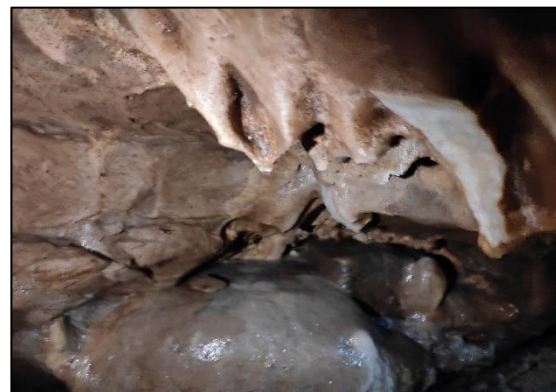
Arwah Cave, Sohra