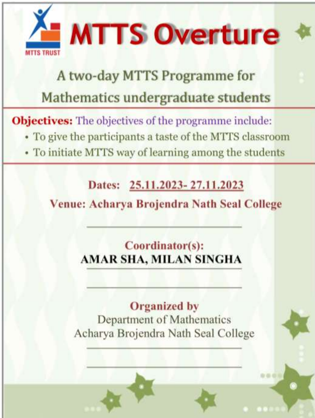
Flyer of the program