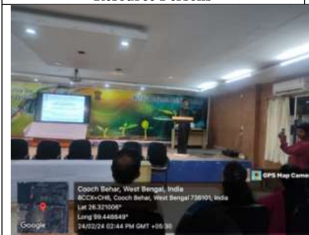
Principal delivering his Welcome Address

Cooch Behar, West Bengal, India 8CCX+CH6, Cooch Behar, West Bengal 736101, India Lat 26.321048° Long 89.448967° 24/02/24 02:32 PM GMT +05:30